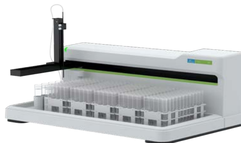
S25 Autosampler (N0830025)