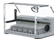
S25 Enclosure N0830021